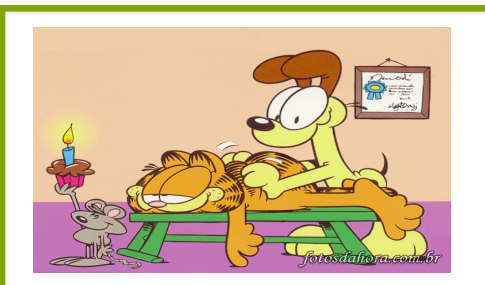
Massage It's What Is Happening

Please call for times if you are not on schedulicity. If you are on Schedulicity .... Please go to www.schedulity.com and book your appointments.