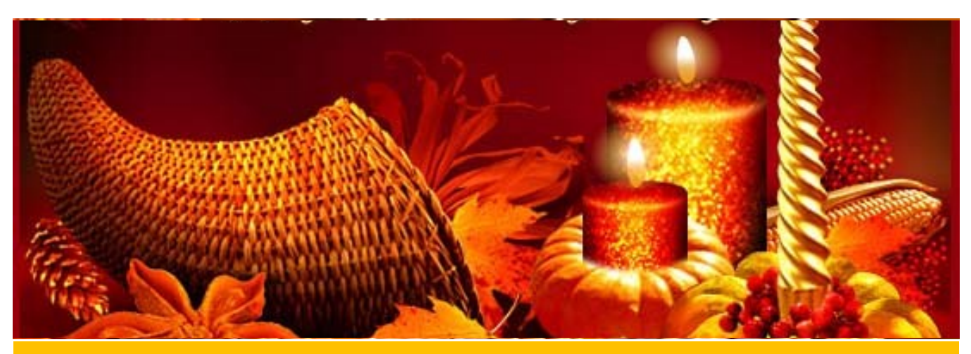
Happy Thanksgiving from Kelling Chiropractic and Viable Options